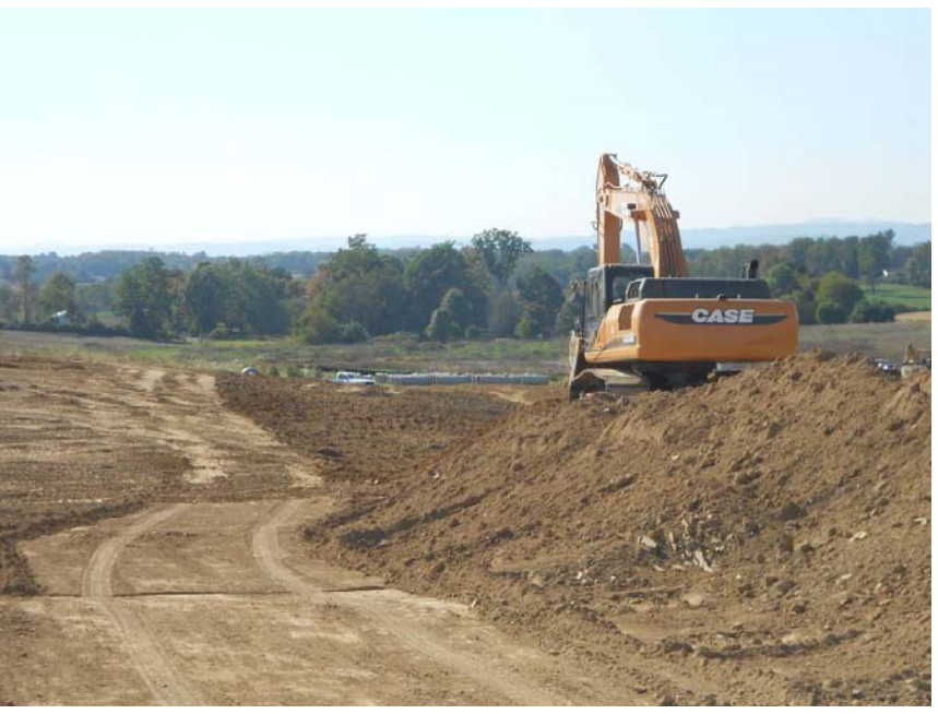
Auburn High School